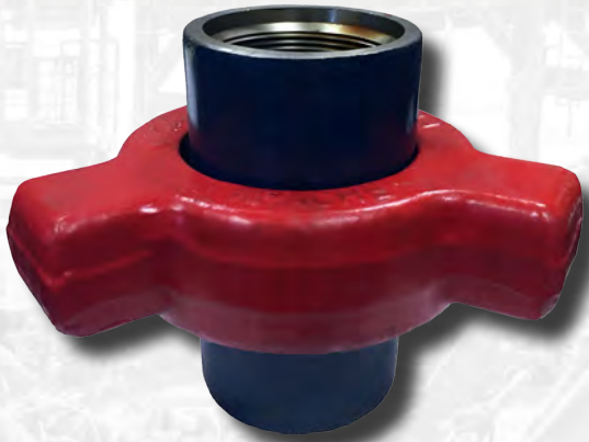
FIG 1002 HAMMER UNION 10000 PSI NSCWP HIGH PRESSURE HAMMER UNION

EQUIPPED WITH A LIP-TYPE SEAL RING FOR REDUCED TURBULENCE