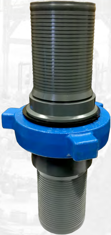
FIG 206 HOSE UNION 400 PSI NSCW HOSE CONNECTION HAMMER UNION