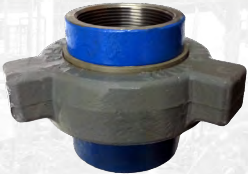
FIG 211 HAMMER UNION 2000 PSI NSCWP INSULATED UNION