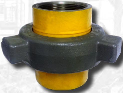
FIG 300 HAMMER UNION 2000 PSI NSCWP FLAT FACE UNION