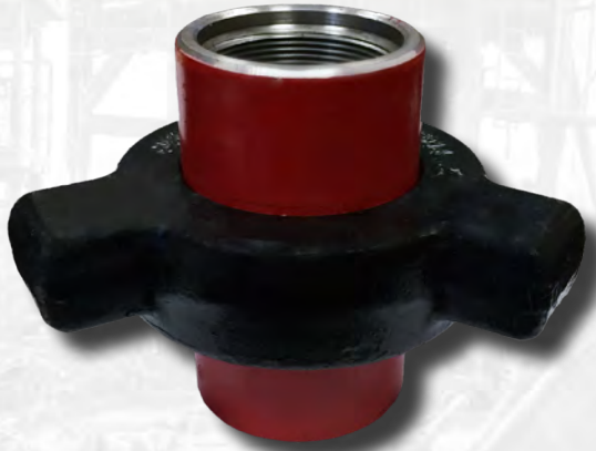
FIG 400 HAMMER UNION 4000 PSI NSCWP FORGED STEEL HAMMER UNION